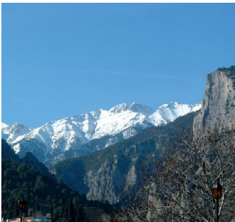
View of Mt. Olympus from Litochoro

On this fascinating journey, with the beautiful landmarks, and impressive sites along the way we experience one of the most scenic hikes in the country, on the highest Greek mountain, Mt. Olympus. This majestic site is where the twelve ancient gods used to call "home". From the mountainous mainland we will set sail to the land of Halkidiki. With its particular shape, like Poseidon's trident stretching into the sea, the peninsulas of Halkidiki are awaiting your discovery.