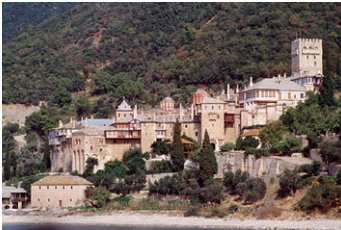
Mt. Athos Monastery